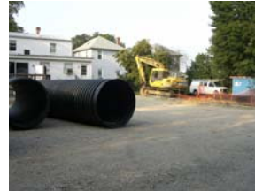
Starting To Dig