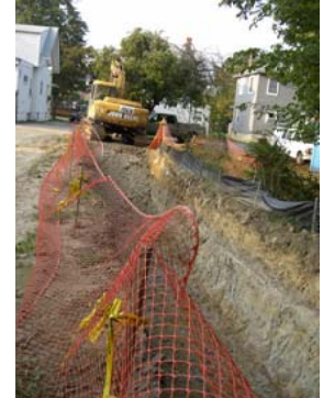
Ready For Pipe