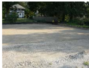
Graded for Paving

Thanks for your prayers, money, and patience!