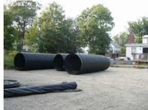
Drainage Pipe Has Arrived