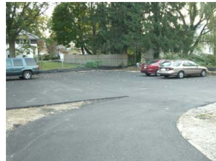
Finally Ready For Parking!

Thanks for your prayers, money, and patience!